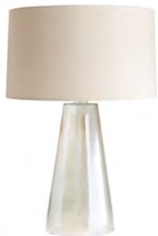
MITCH LAMP 44378-552