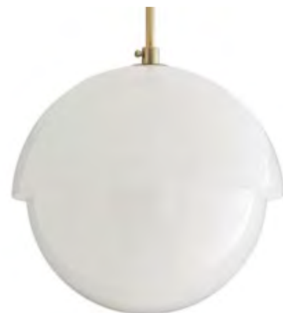
UNDERWOOD PENDANT 49253