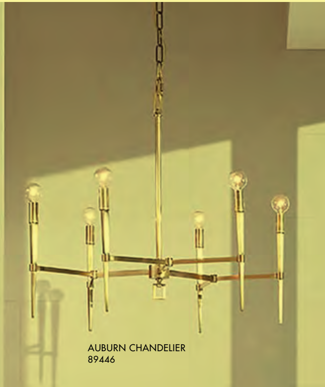
AUBURN CHANDELIER 89446