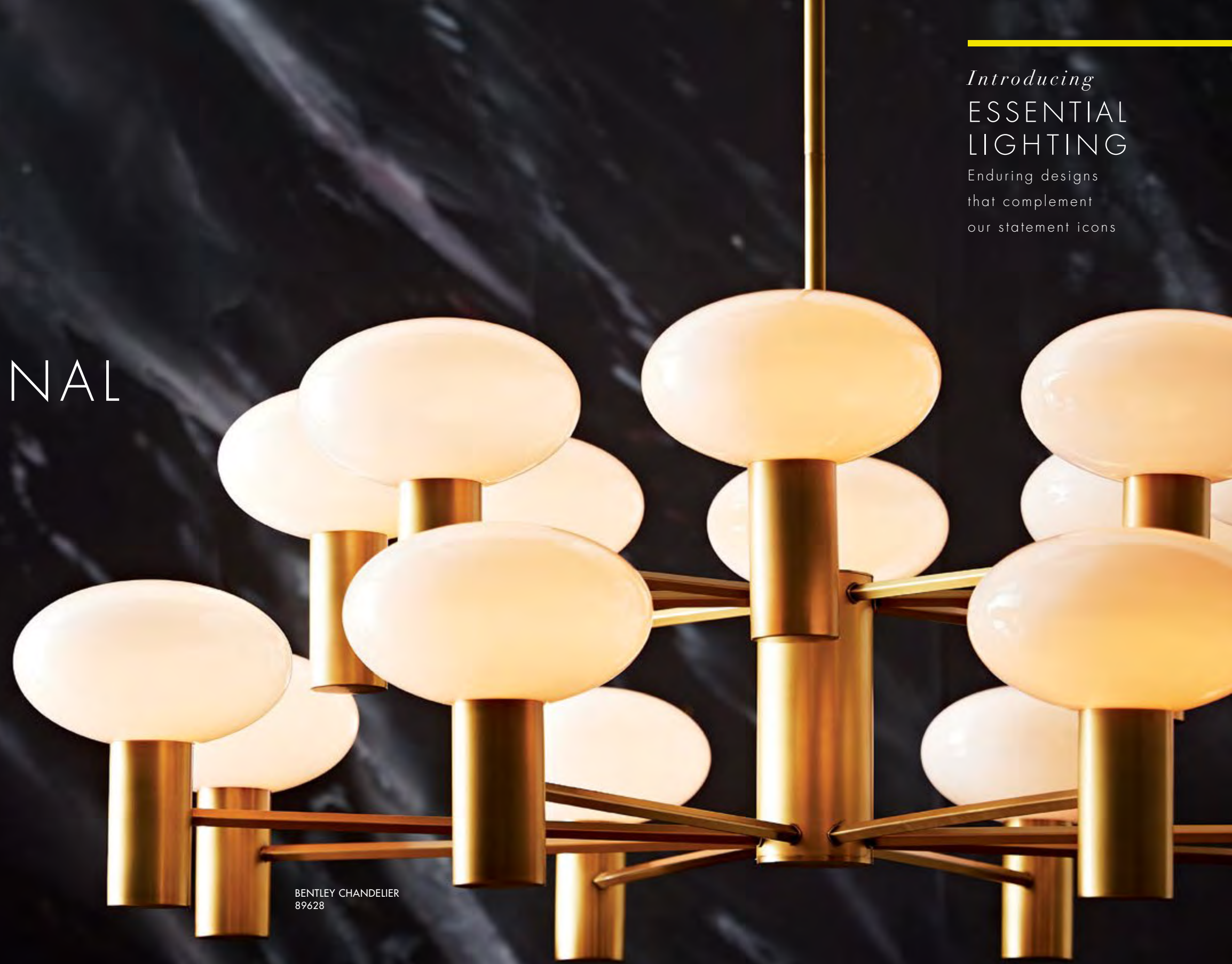
BENTLEY CHANDELIER 89628

Our latest launch ushers in a new era for Arteriors, one in which we explore the symbiotic nature between the bold & basic. Each season, Arteriors will debut a curated assortment of well-crafted design essentials to complement the statement-making icons you've grown to love. They're the little black dress, perfect for layering in multiple settings today, tomorrow and beyond.