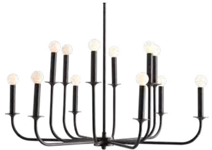
BRECK SMALL CHANDELIER 89344