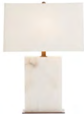
CARSON LAMP 42328-798