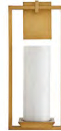
TRAPEZE SCONCE DB49013