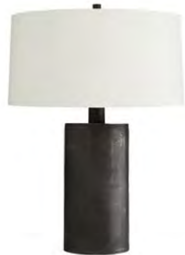
PRAGUE LAMP 44447-188