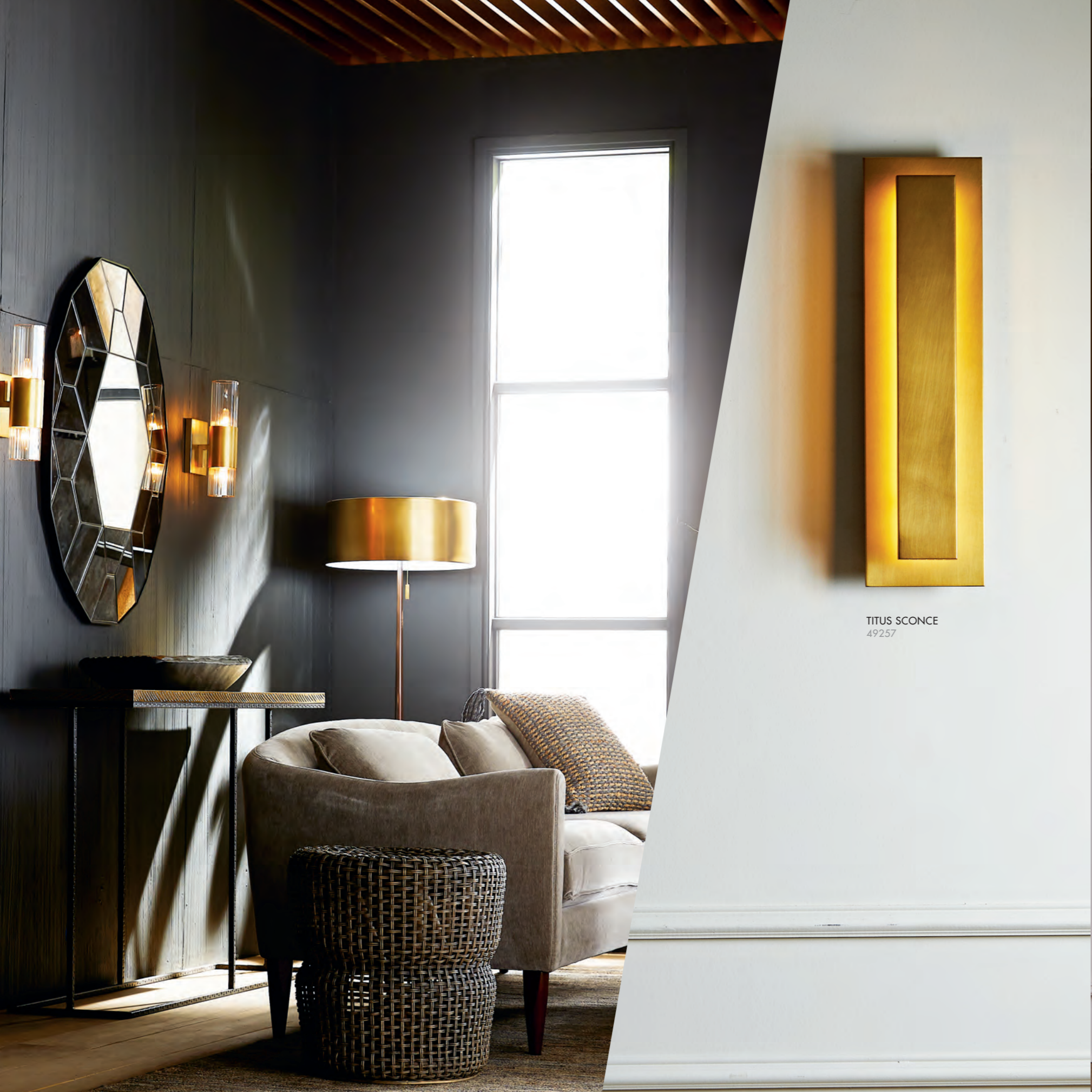
TITUS SCONCE 49257