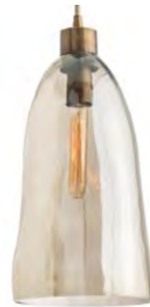
DOREEN PENDANT 44084