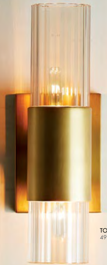
TOMPKINS SCONCE 49334