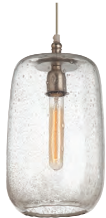
SHELTON CYLINDER PENDANT 46646