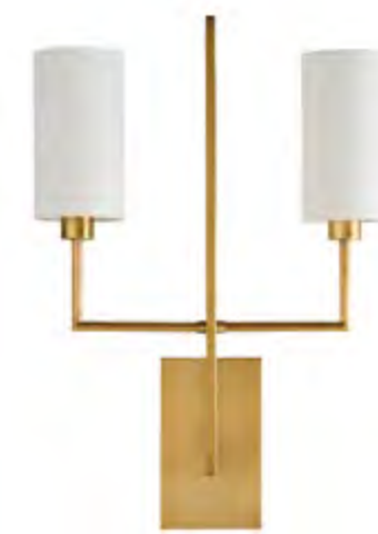
BLADE SCONCE DB49017