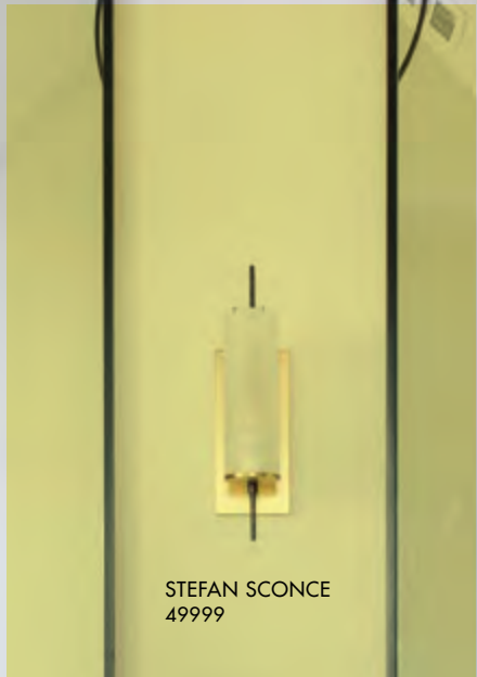
STEFAN SCONCE 49999