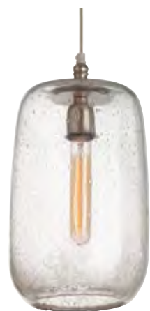
SHELTON CYLINDER PENDANT 46646