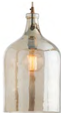
NOREEN PENDANT 44081