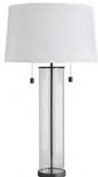
SAVANNAH LAMP 49878-867