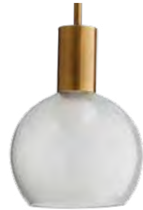
AVA PENDANT 44911