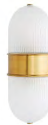
WINTHROP SCONCE 49250