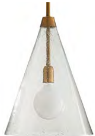
WEISS PENDANT 46426