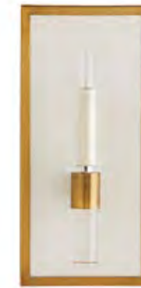
GRIFFITH SCONCE DP49003