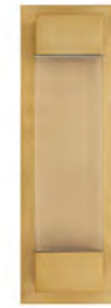
CHARLIE SCONCE 49368