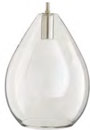
NALA PENDANT 49174