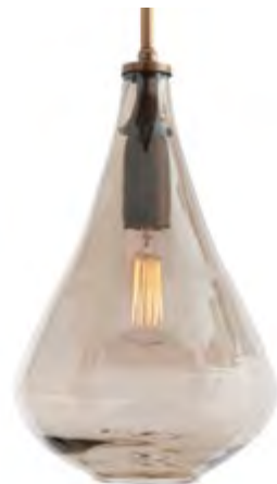
ALBERT PENDANT 44083