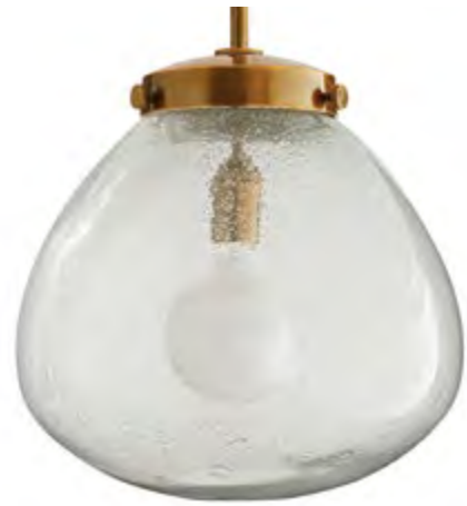
WELCH PENDANT 46413