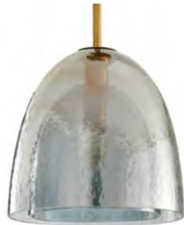
JENNA PENDANT 42247