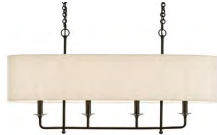
BEATTY CHANDELIER 89417