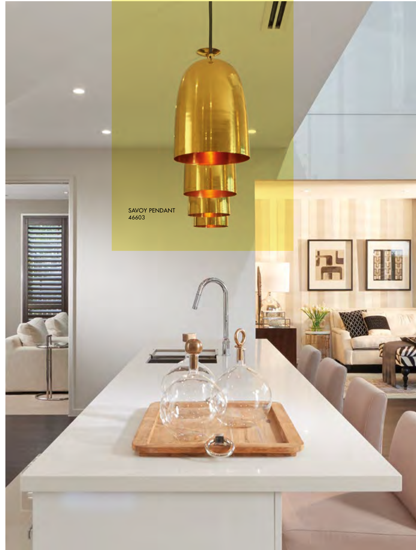
SAVOY PENDANT 46603