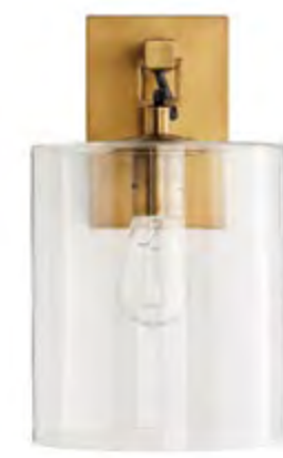
PARRISH SCONCE 49086