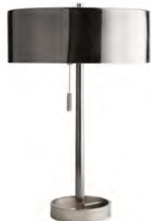
VIOLETTA LAMP 49651