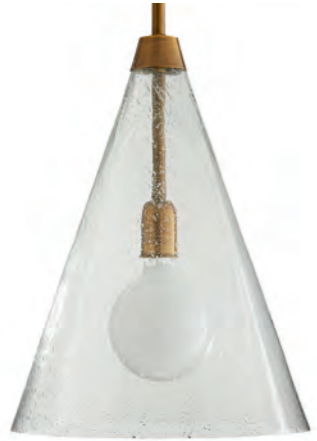
WEISS PENDANT 46426