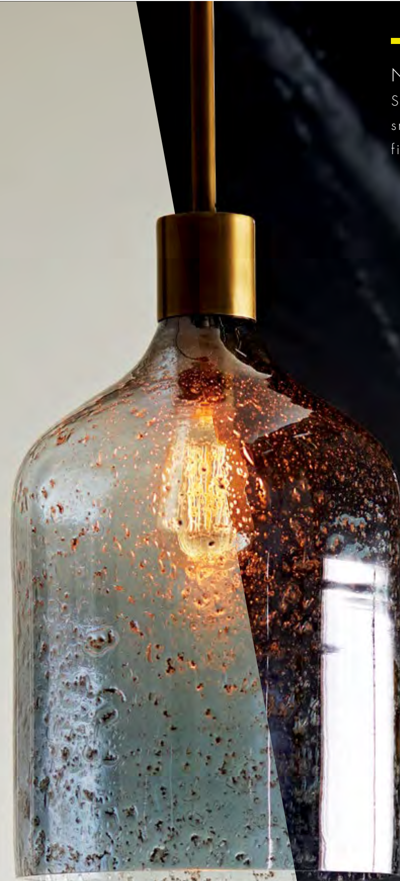
NOREEN PENDANT 44910

NOREEN PENDANT Seedy glass featuring a smoky blue tint with a luster finish & sleek brass canopy.