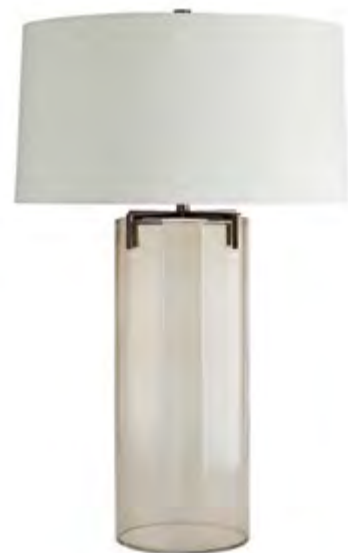
DALE LAMP 49351-735