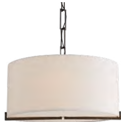
DRUM PENDANT DB49002