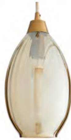
AMBER PENDANT 42490