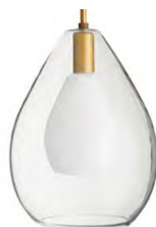
NALA PENDANT 49098