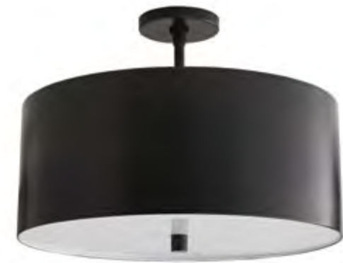
TARBELL SEMI-FLUSH 49267