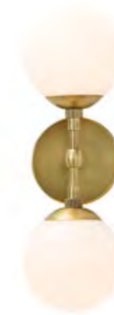
POLARIS SCONCE 49961