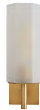
SOLOMAN SCONCE 49646