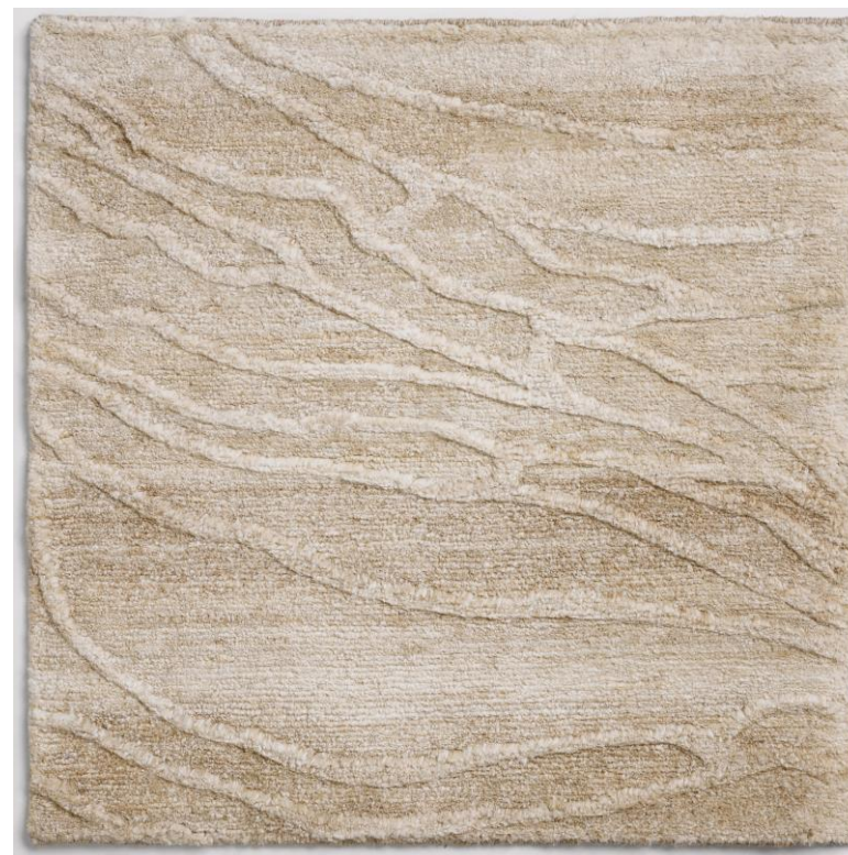
Hand-knotted 100K Nettle