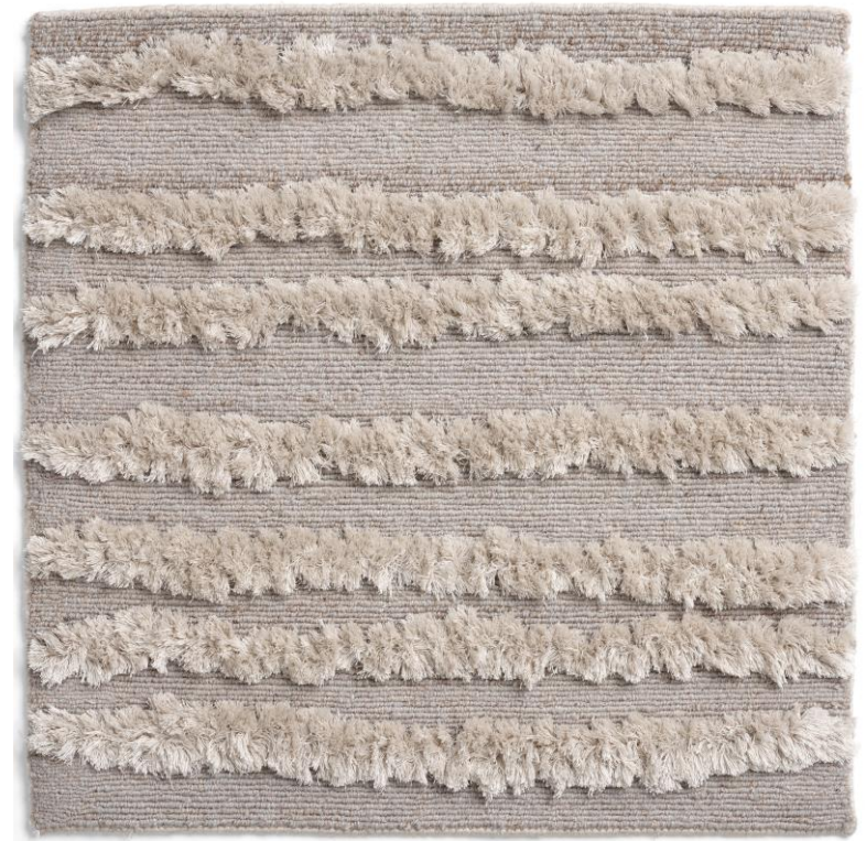
Hand-knotted 100K Wool / Silk / Aloe