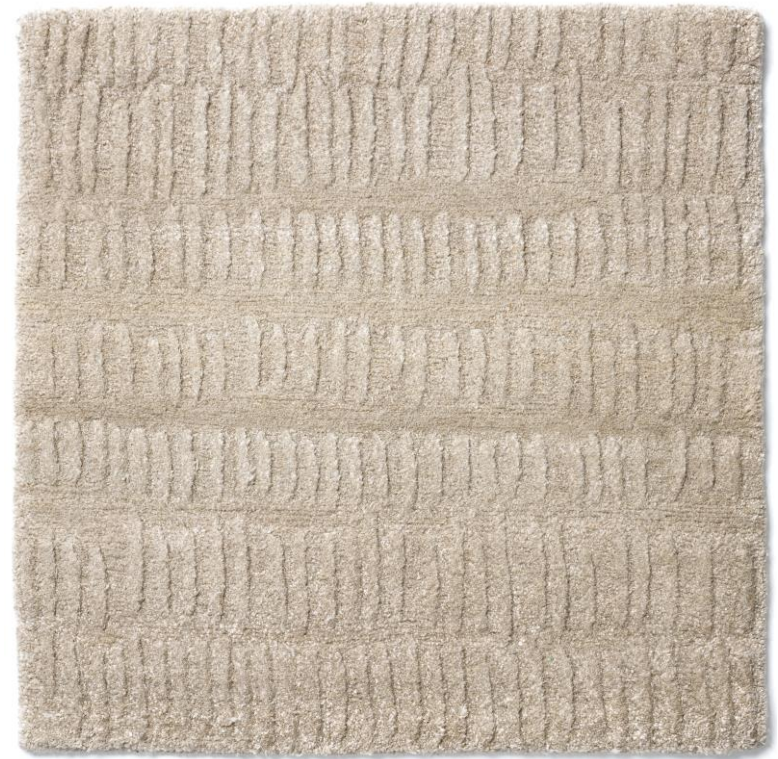
Hand-knotted 100K Wool / Silk / Nettle