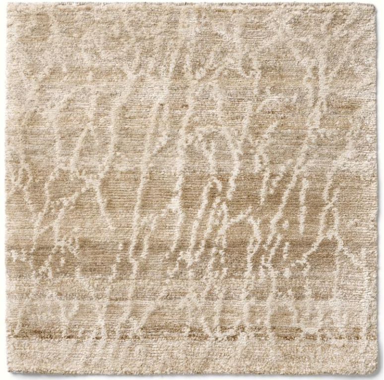
Hand-knotted 100K Silk / Nettle