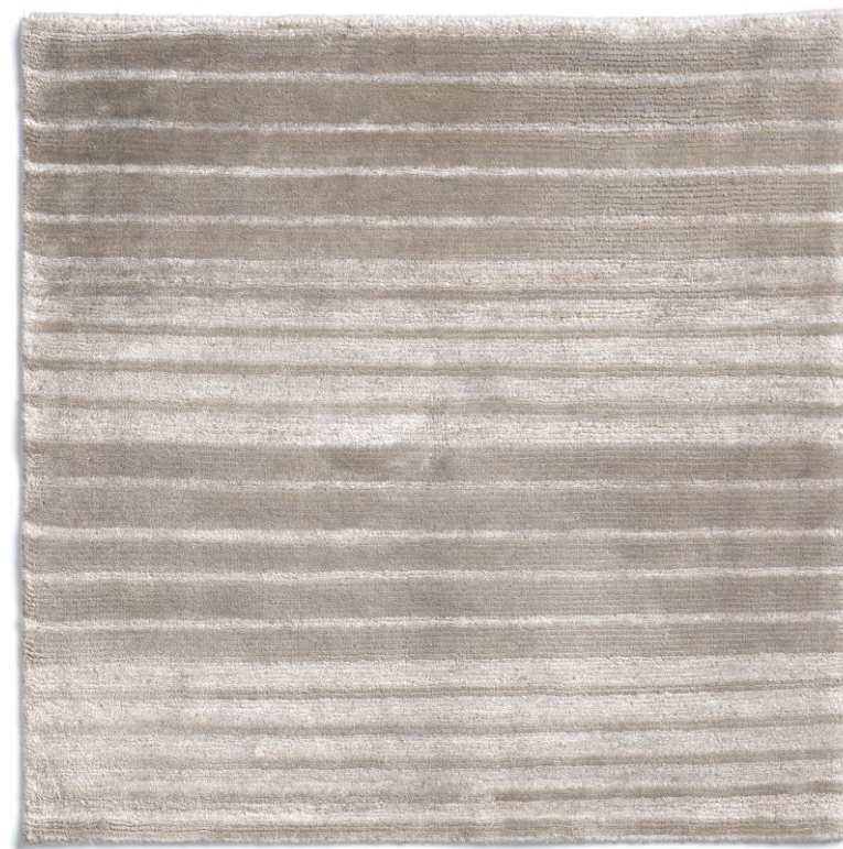
Hand-knotted 100K Silk / Nettle