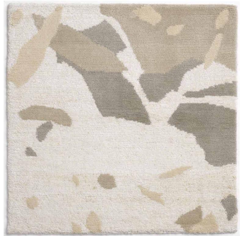
Hand-knotted 100K Silk / Nettle