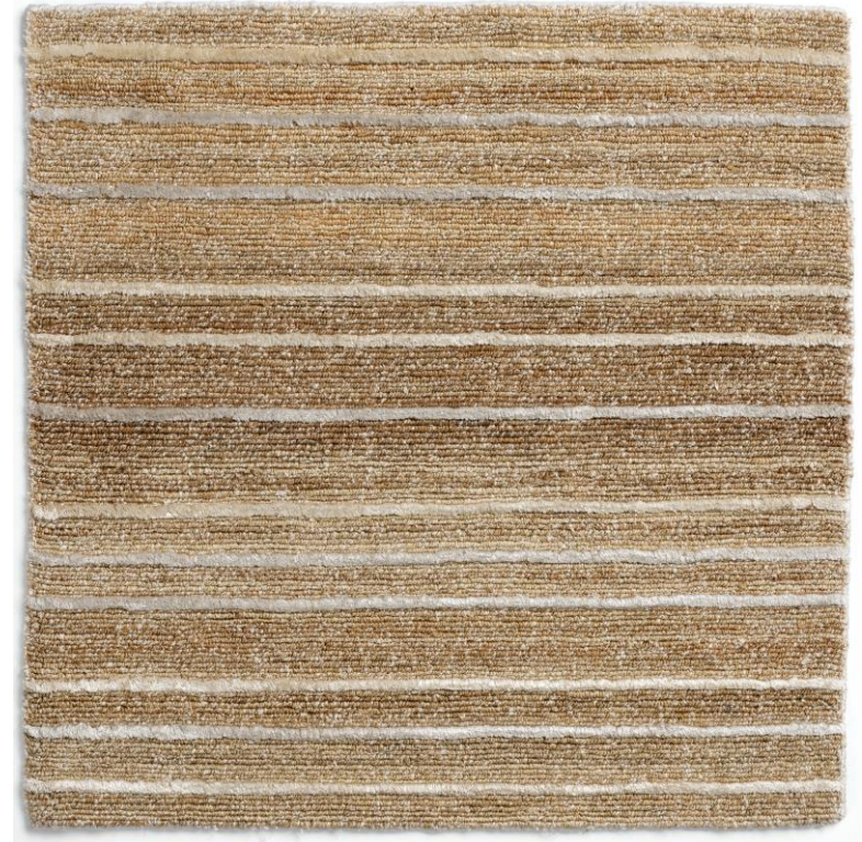
Hand-knotted 100K Matka Silk / Nettle