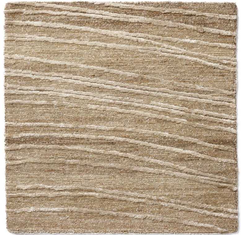
Hand-knotted 150K Wool / Sunpat / Silk