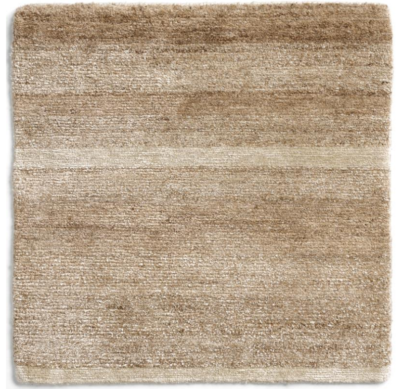
Hand-knotted 100K Matka Silk / Nettle