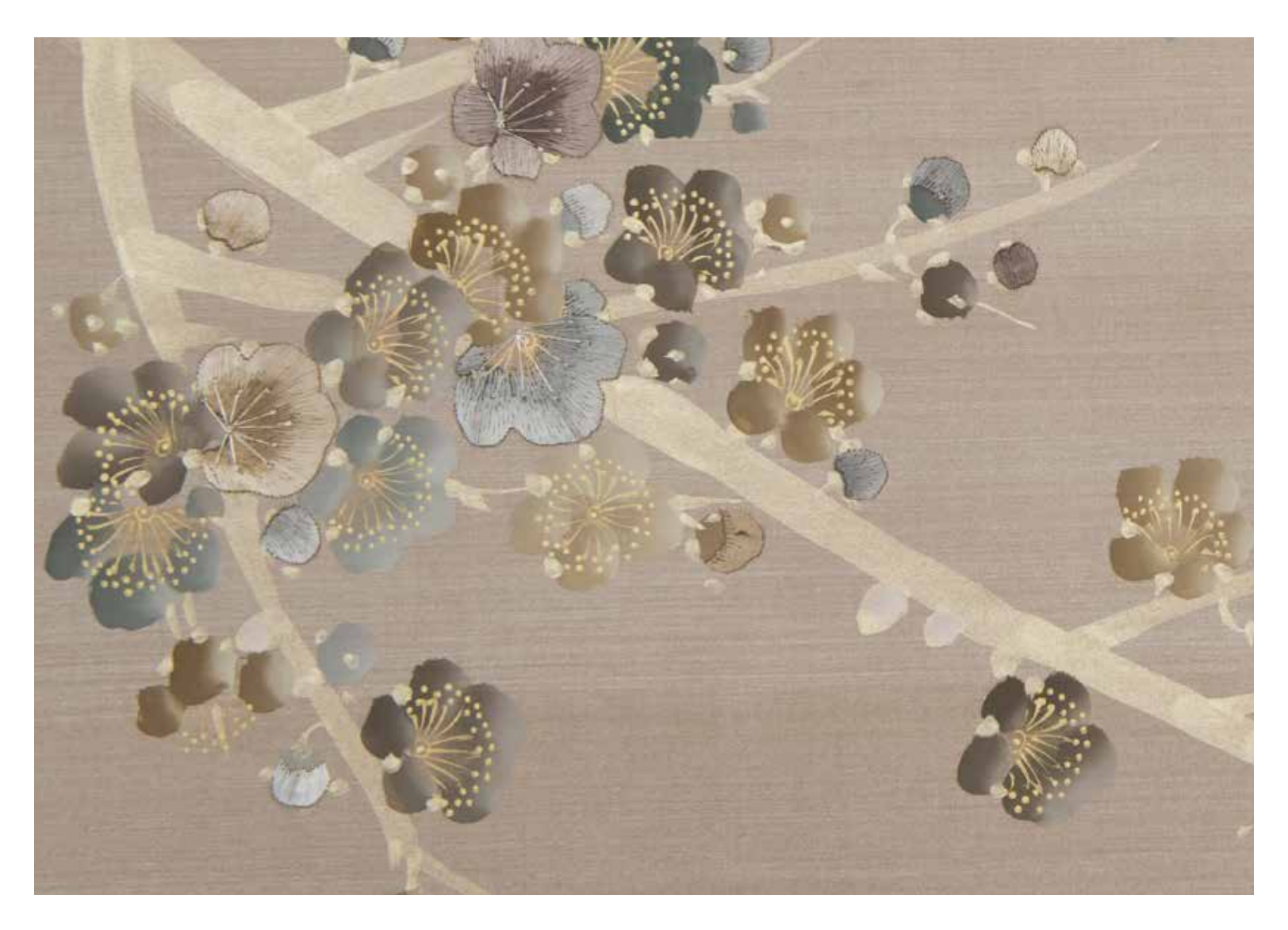
Prunus Dove Grey on Galena Strata