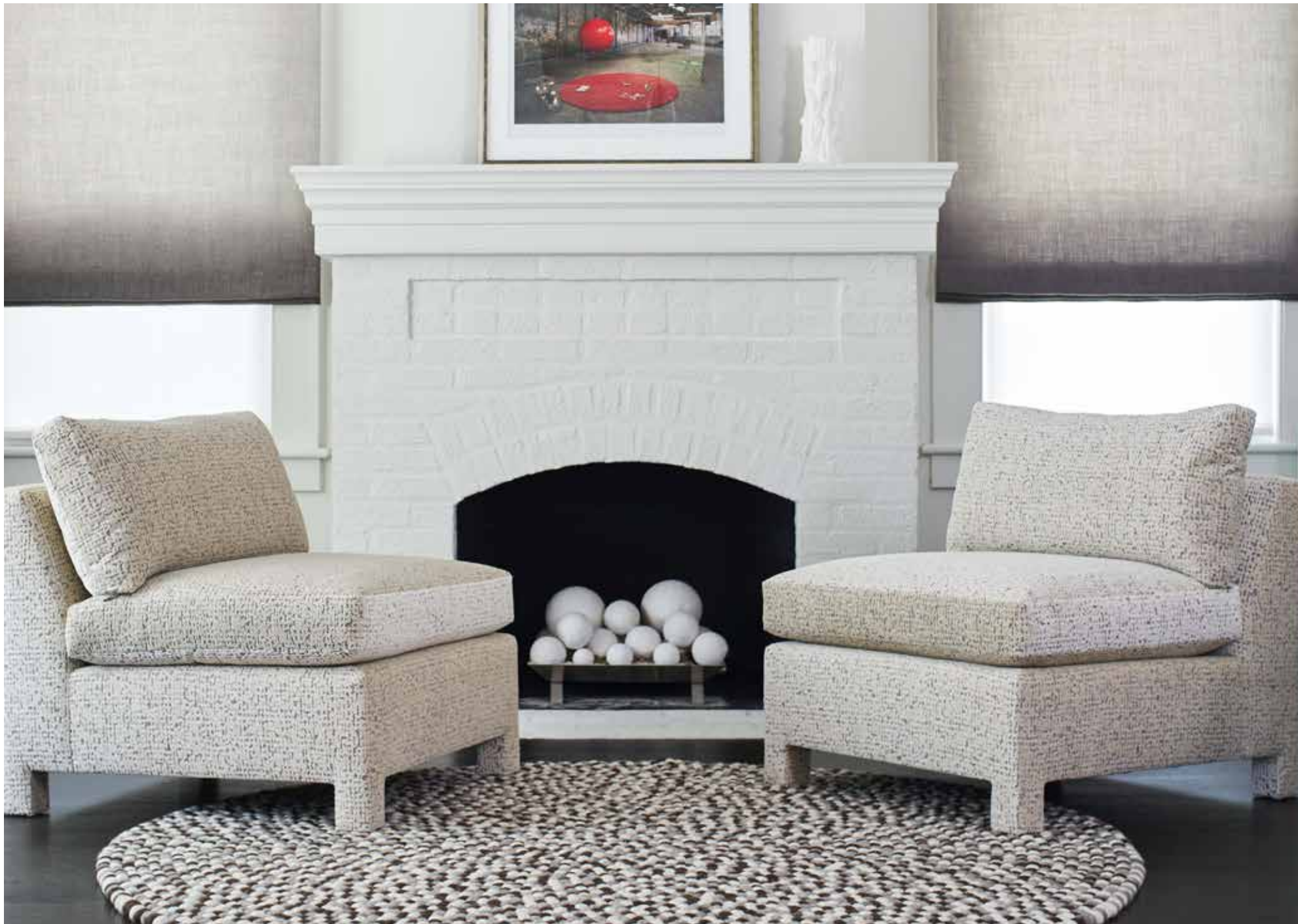
32 Roman Shades: Ombré Alpaca Linen in Pine Bark; Chairs: Velvet Verona in Birch; Rug: Felt Marble in Driftwood