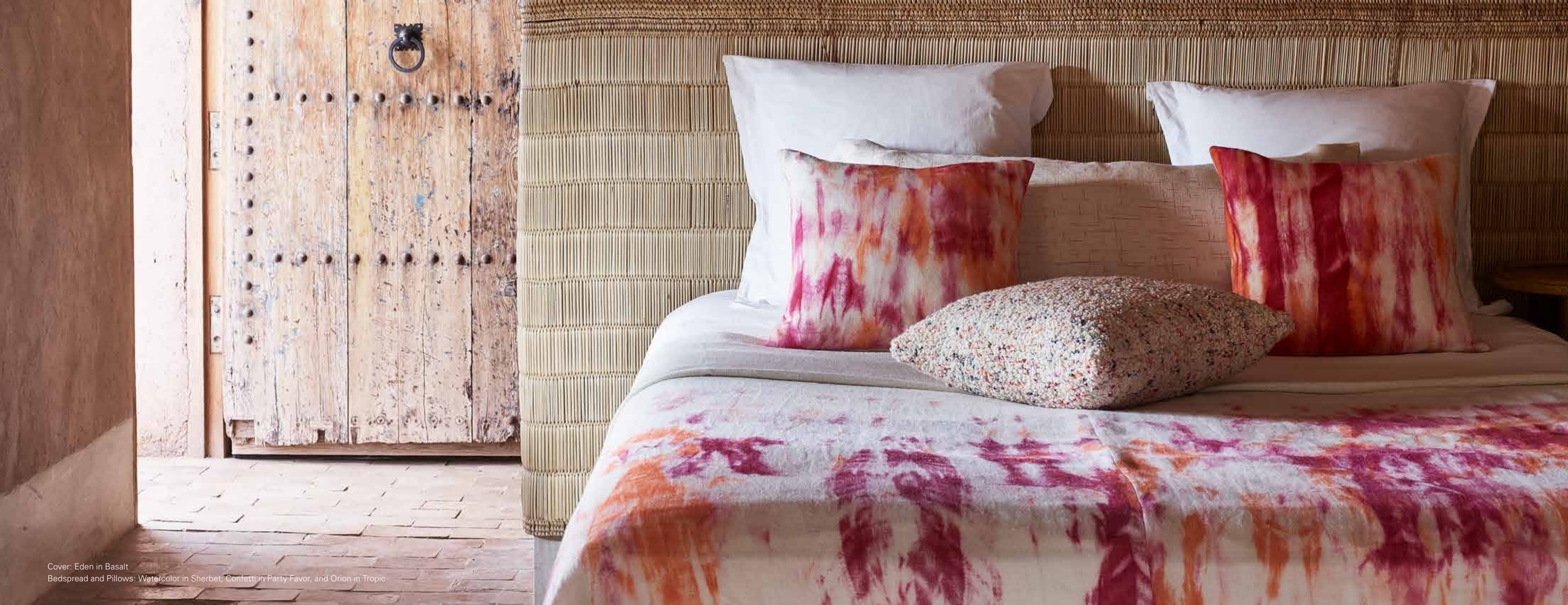
Cover: Eden in Basalt Bedspread and Pillows: Watercolor in Sherbet, Confetti in Party Favor, and Orion in Tropic