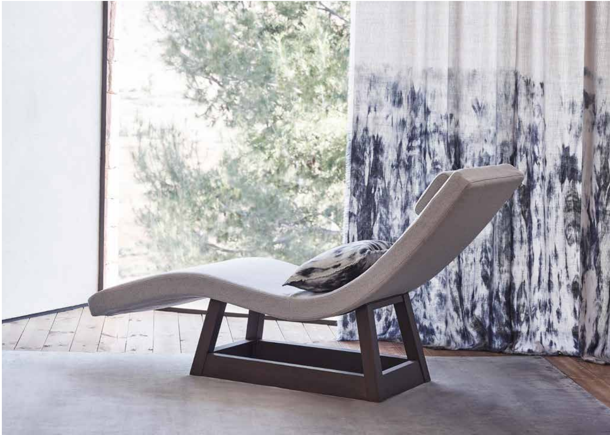
10 Drapery: Watercolor in Shadow Ice; Chair: Isla in Clamshell; Pillow: Watercolor in Shadow Ice; Rug: Ombré Silk in Heron