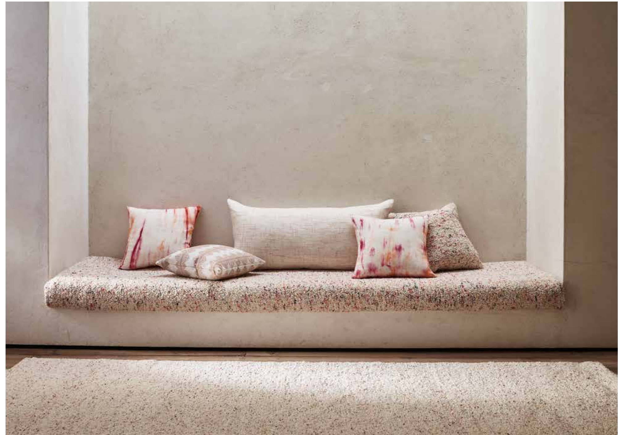
Rug and Bench: Confetti in Party Favor; Pillows: Confetti in Party Favor, Orion in Tropic, Watercolor in Sherbet, Eden in Koi 5