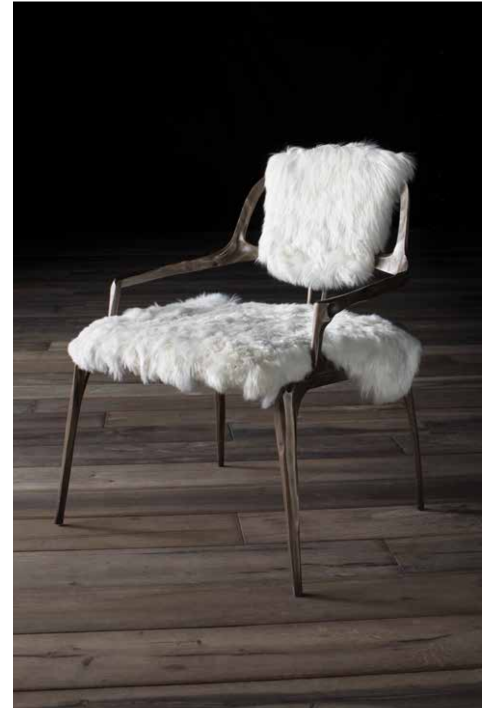
Kinta Chair: Suri Fur in White 41