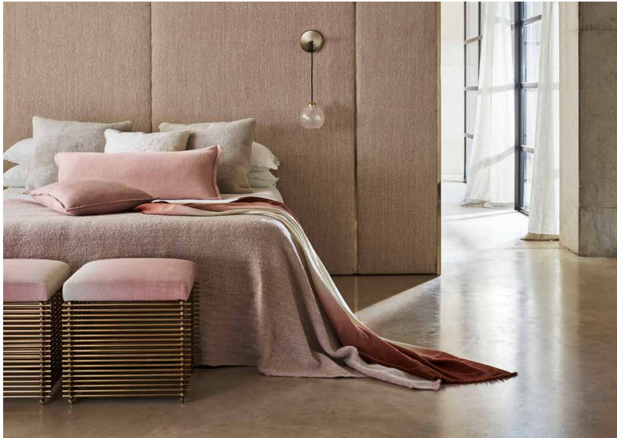
Headboard and Bed Cover: Double Weave Alpaca Bouclé in Shortcake; Throw: Ombré Alpaca in Rust; Pillows: Alpaca Linen in Flamingo, Arrabelle Shearling in Blush, Eco Shearling in Ibis; Benches: Ombré Alpaca Linen in Rose Quartz