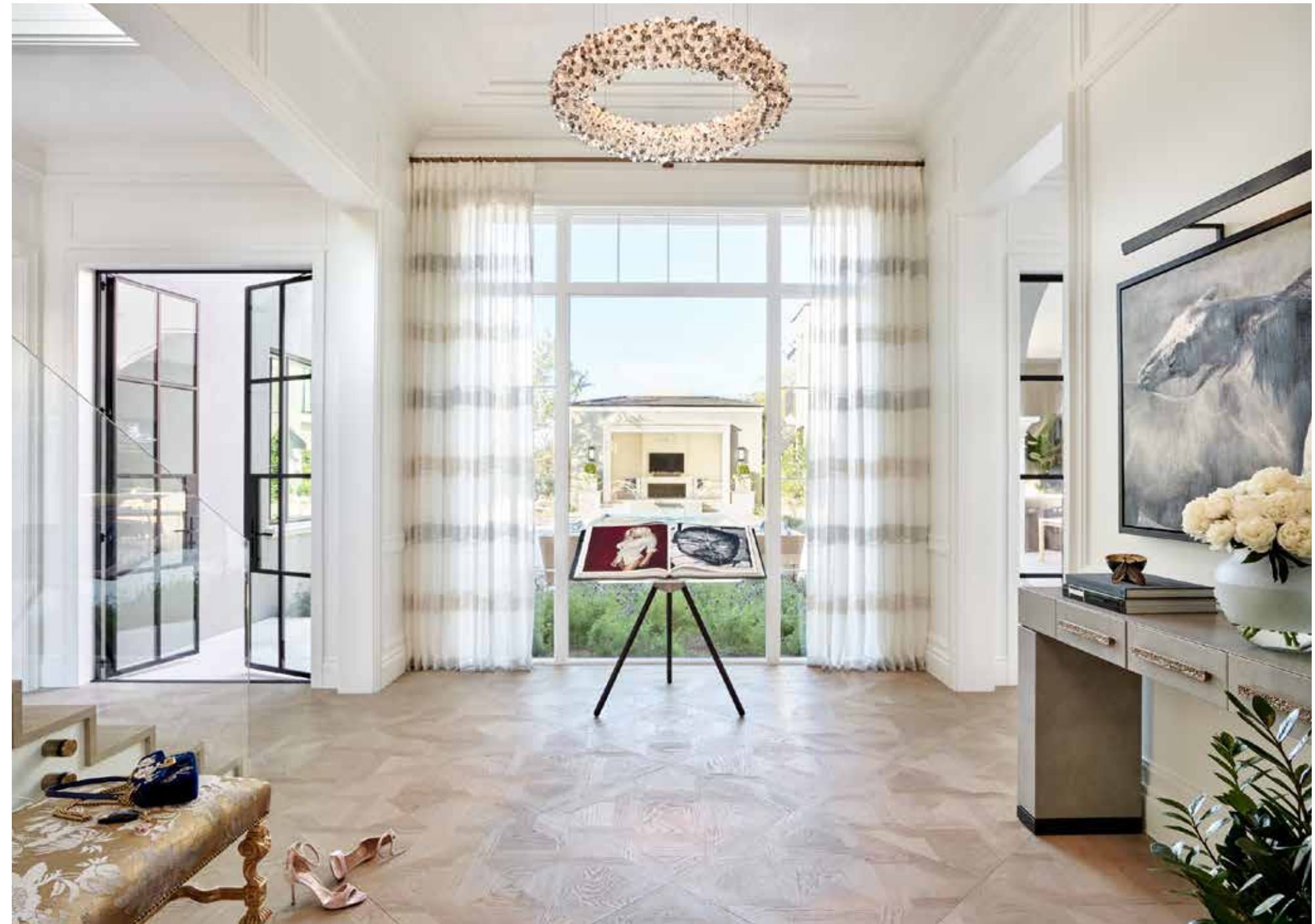
Drapery: Demetra Sheer Linen in Bone 33