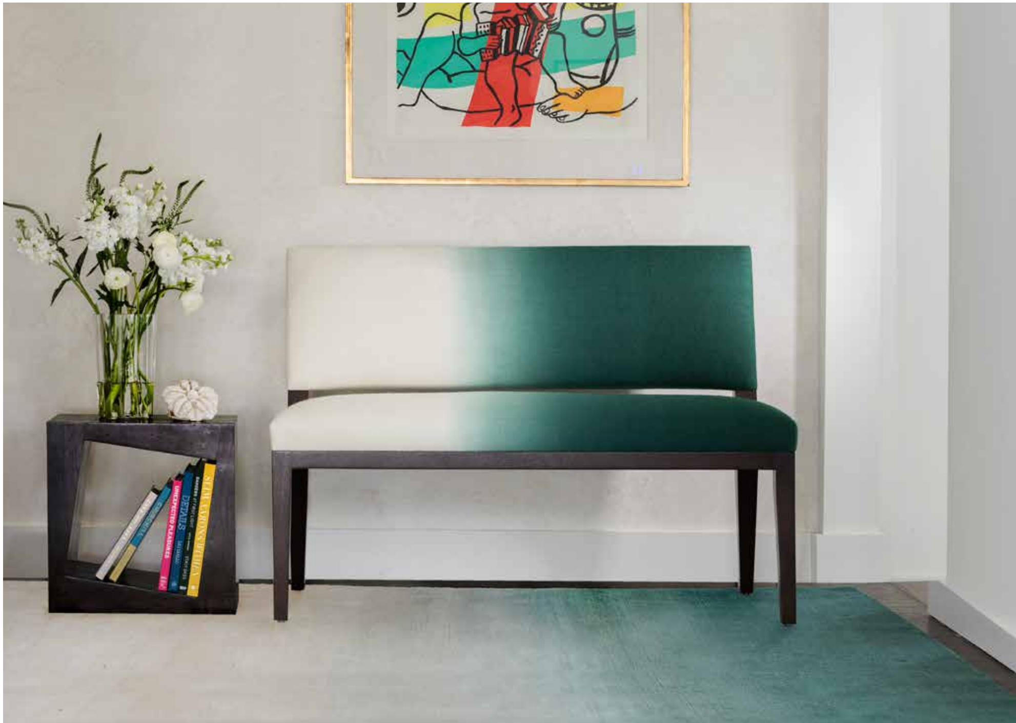
24 Bench: Ombré Alpaca in Emerald; Rug: Ombré Wool in Emerald