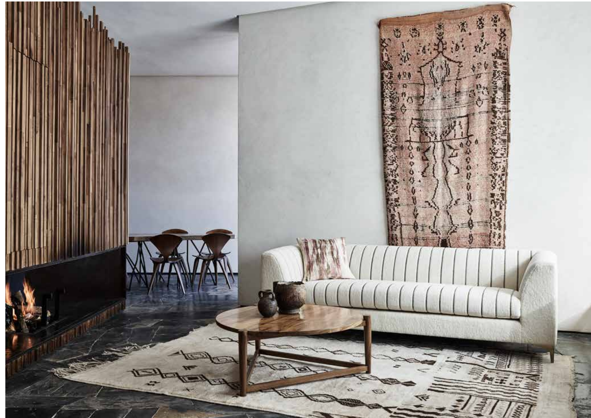
Sofa: Laria and Elia in Oro and Cream; Pillow: Watercolor in Bronze Orchid 7