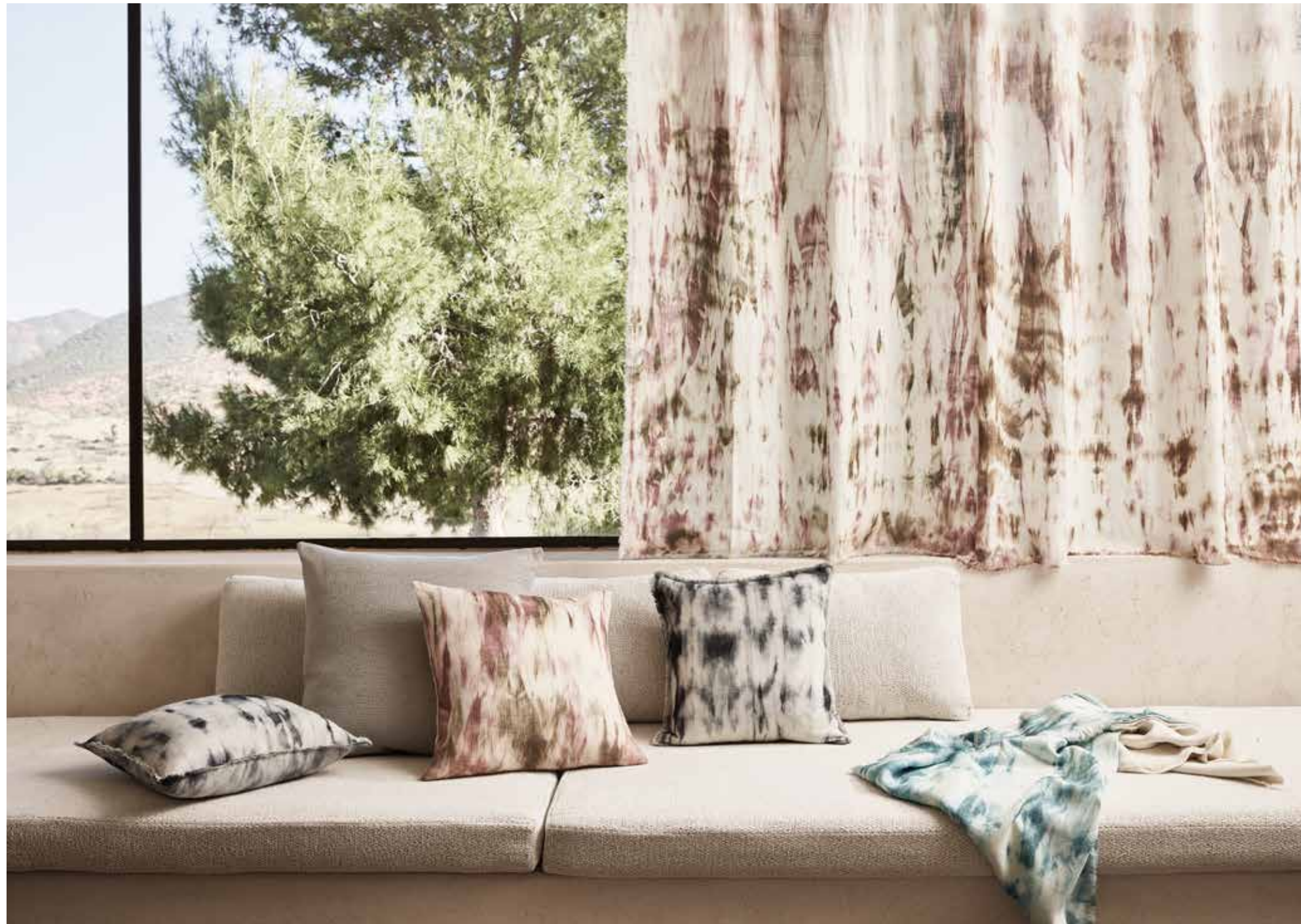
6 Drapery: Watercolor in Bronze Orchid; Sofa: Froth in Athena; Pillows: Watercolor in Smolder and Bronze Orchid, Froth in Athena and Stingray; Throw: Watercolor in Tealberry