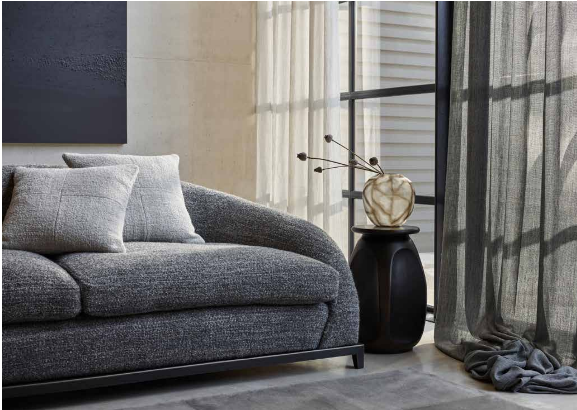
34 Drapery: Alpaca Linen Sheer Glam in Frost and Spectra; Sofa: Double Weave Alpaca Bouclé Glam in Galaxy; Pillow: Double Weave Alpaca Bouclé Glam in Moondust; Rug: Eco Shearling in Caribou