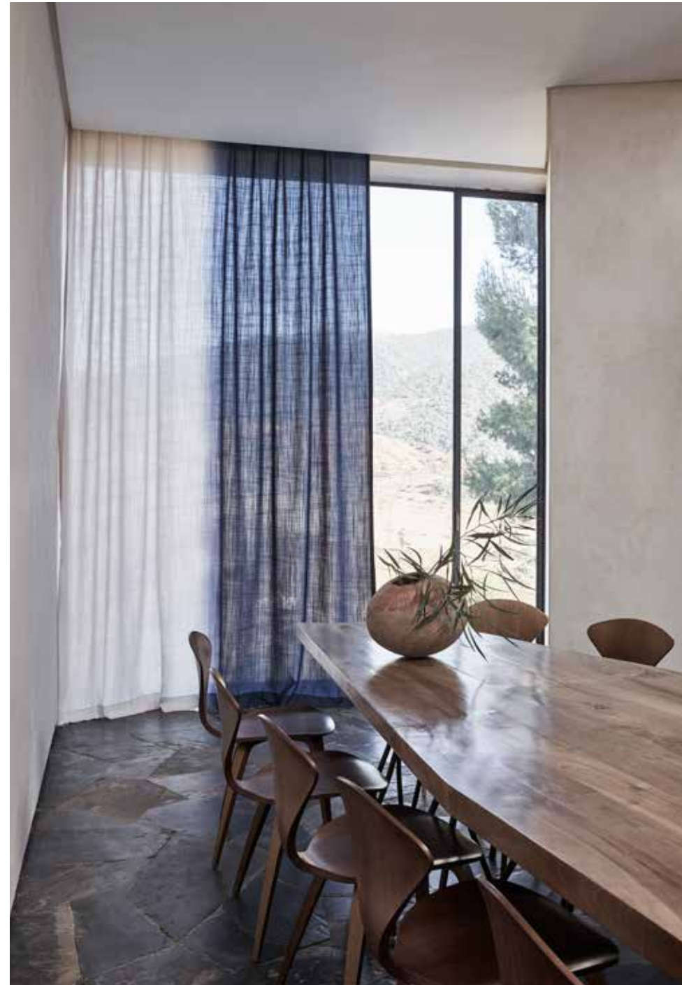
Drapery: Ombré Contract in Malibu