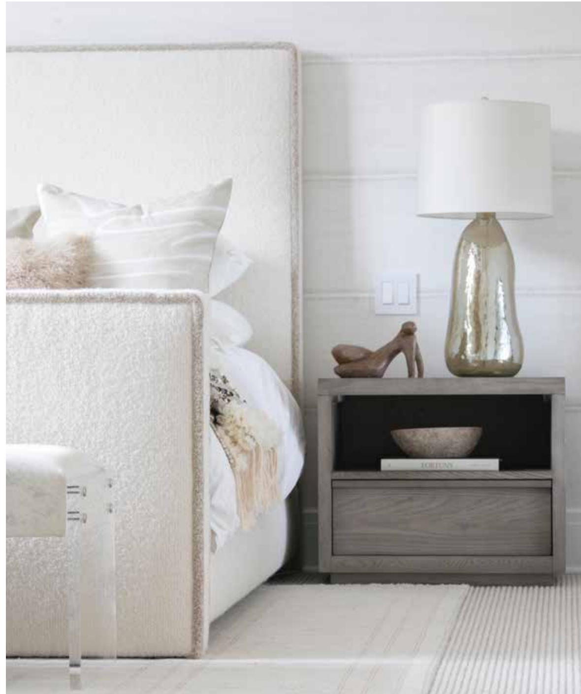
40 Headboard: Double Weave Alpaca Bouclé in White