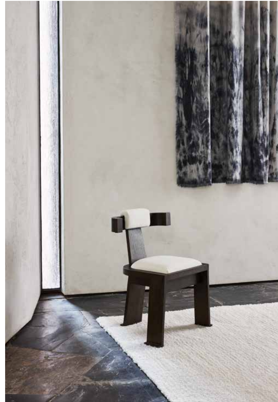
Chair: Froth in Castaway; Drapery: Watercolor in Smolder 13