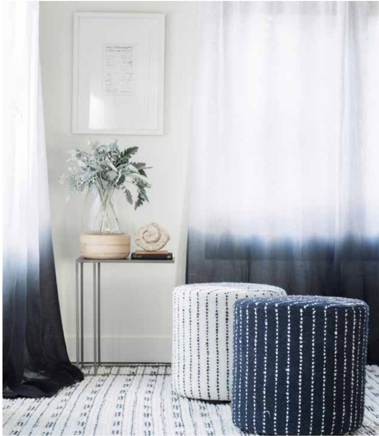
30 Drapery: Ombré Linen Sheer in Indigo; Poufs: Chalk Stripe in White/Navy & Ink/White; Rug: Misti in Admiral