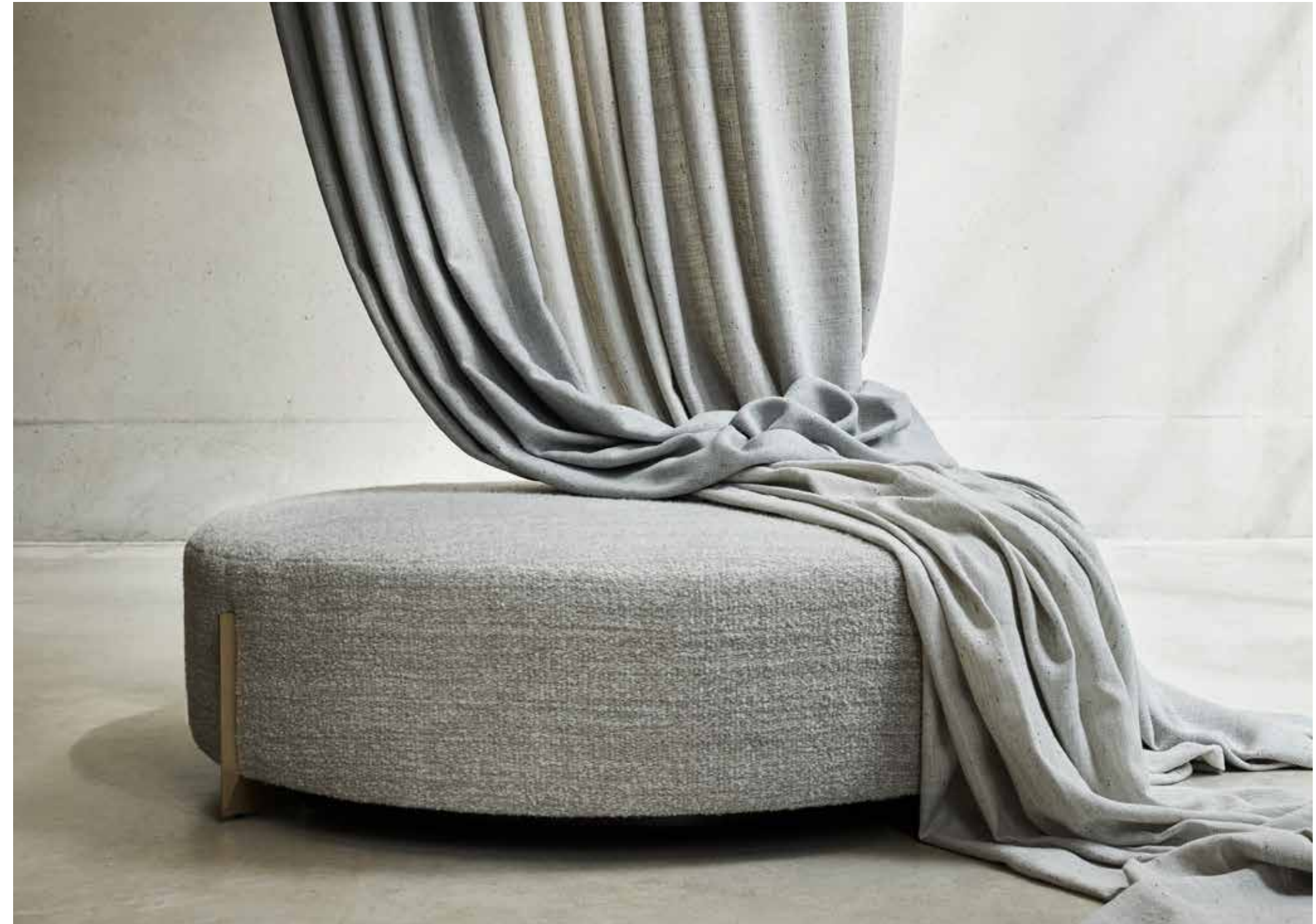
Ottoman: Double Weave Alpaca Bouclé Glam in Moondust; Fabric: Alpaca Linen Fleck in Aura