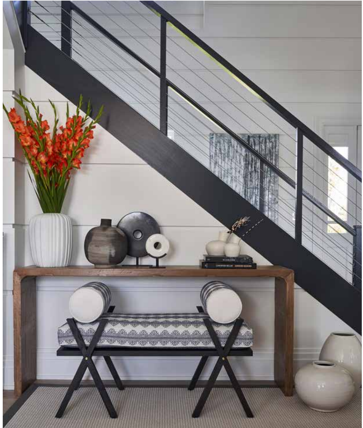
18 Bench: Eden in Dune