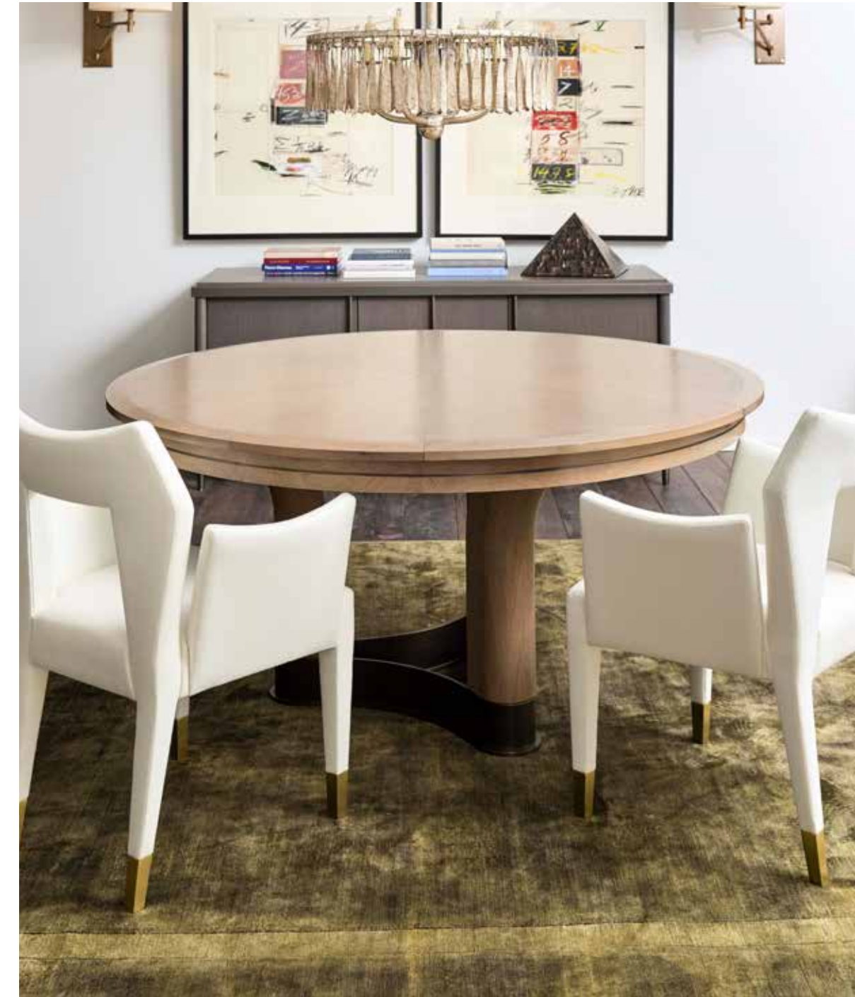
Rug: Ombré Silk in Olive Musk 51