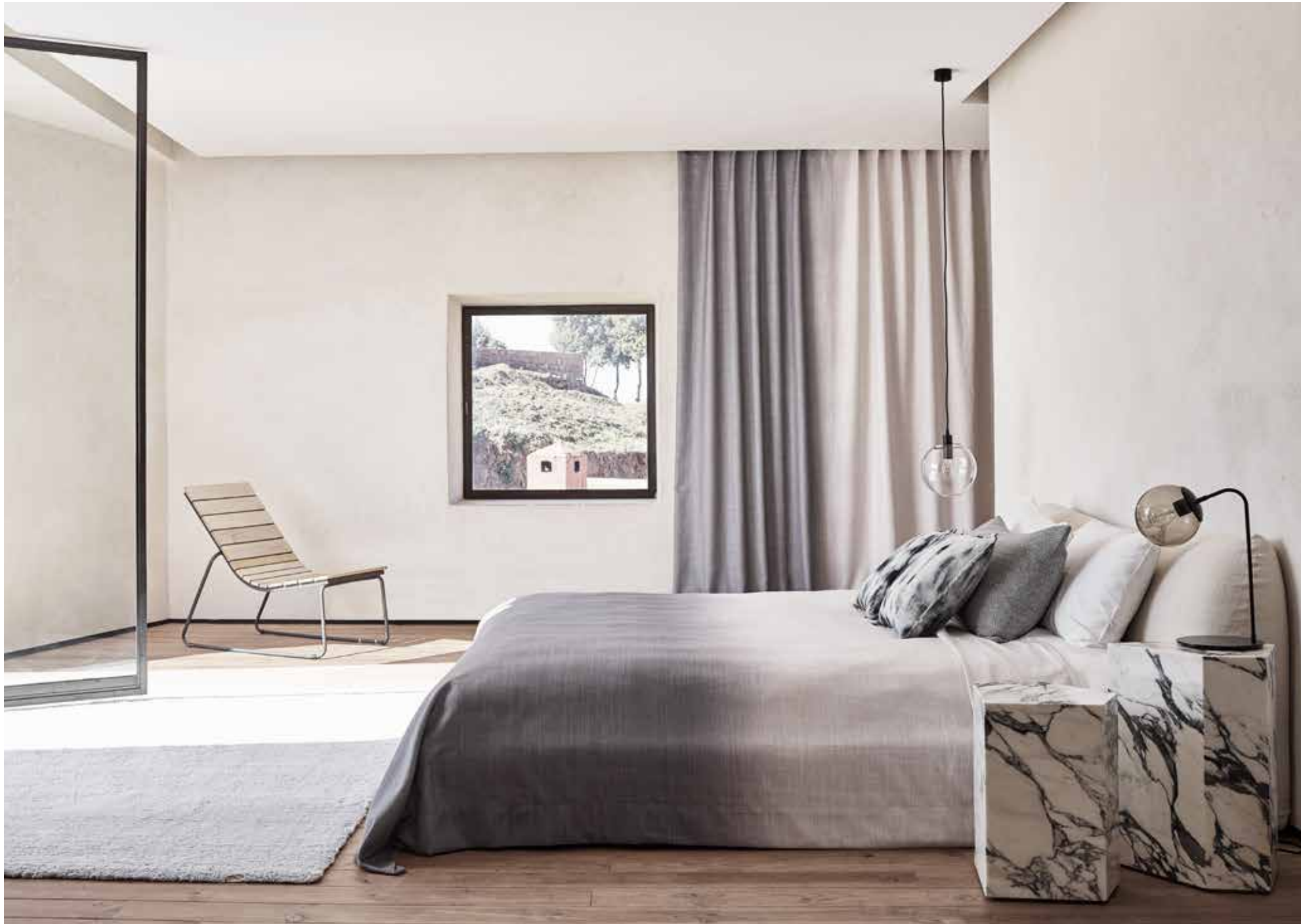
12 Drapery: Ombré Contract in Zinc; Bedspread: Ombré Contract in Zinc; Pillows: Watercolor in Smolder, Froth in Stingray