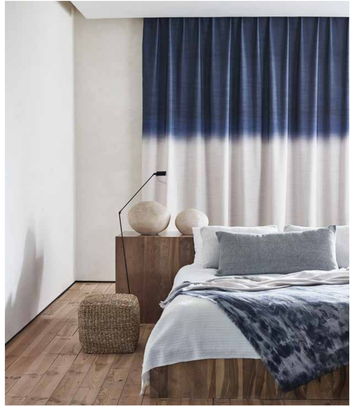
Drapery: Ombré Contract in Malibu; Pillows in Froth Stingray and Venus; Throw: Watercolor in Shadow Ice and Pencil Stripe in Paperwhite 11