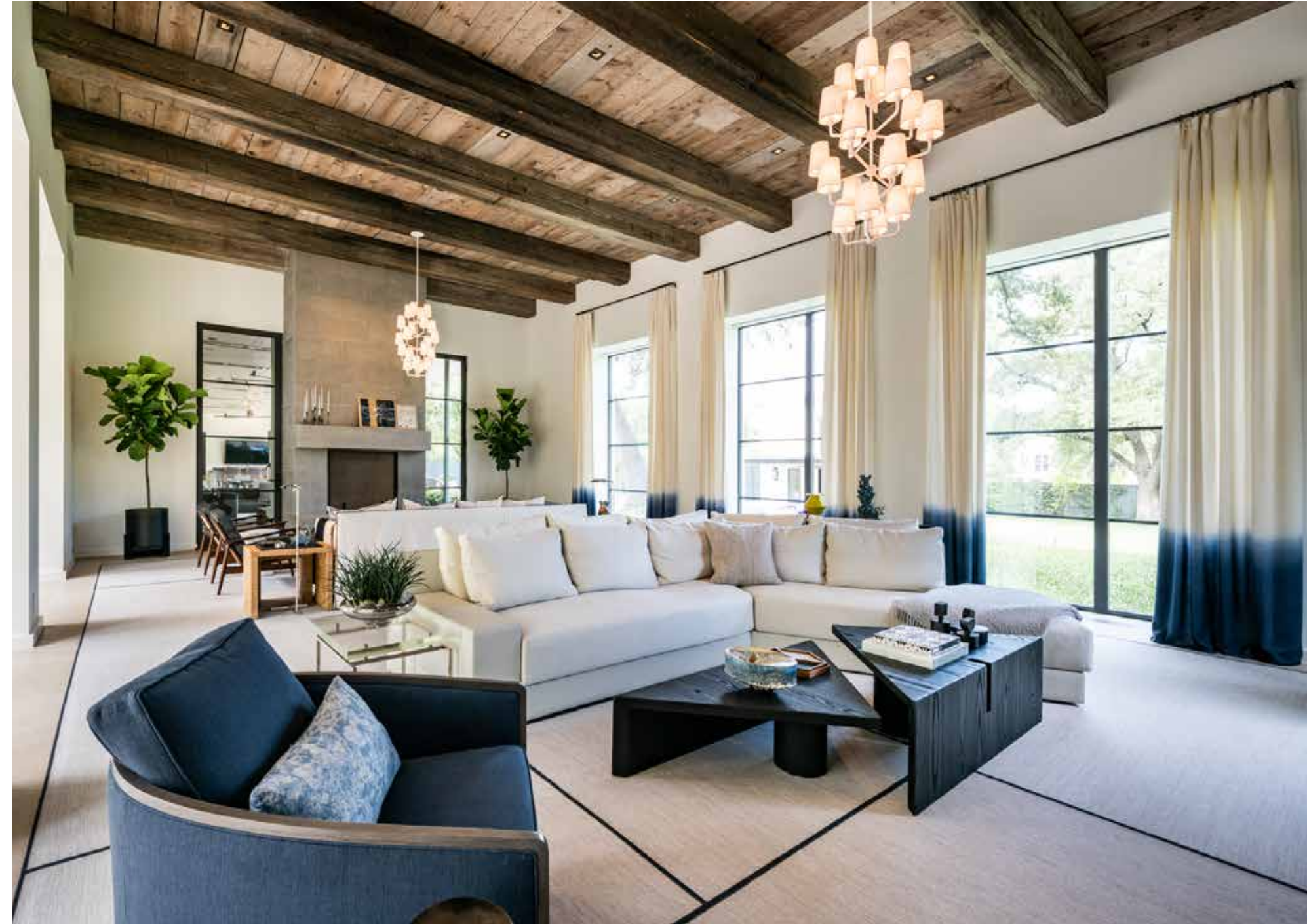
Drapery: Ombré Alpaca in Malibu 23