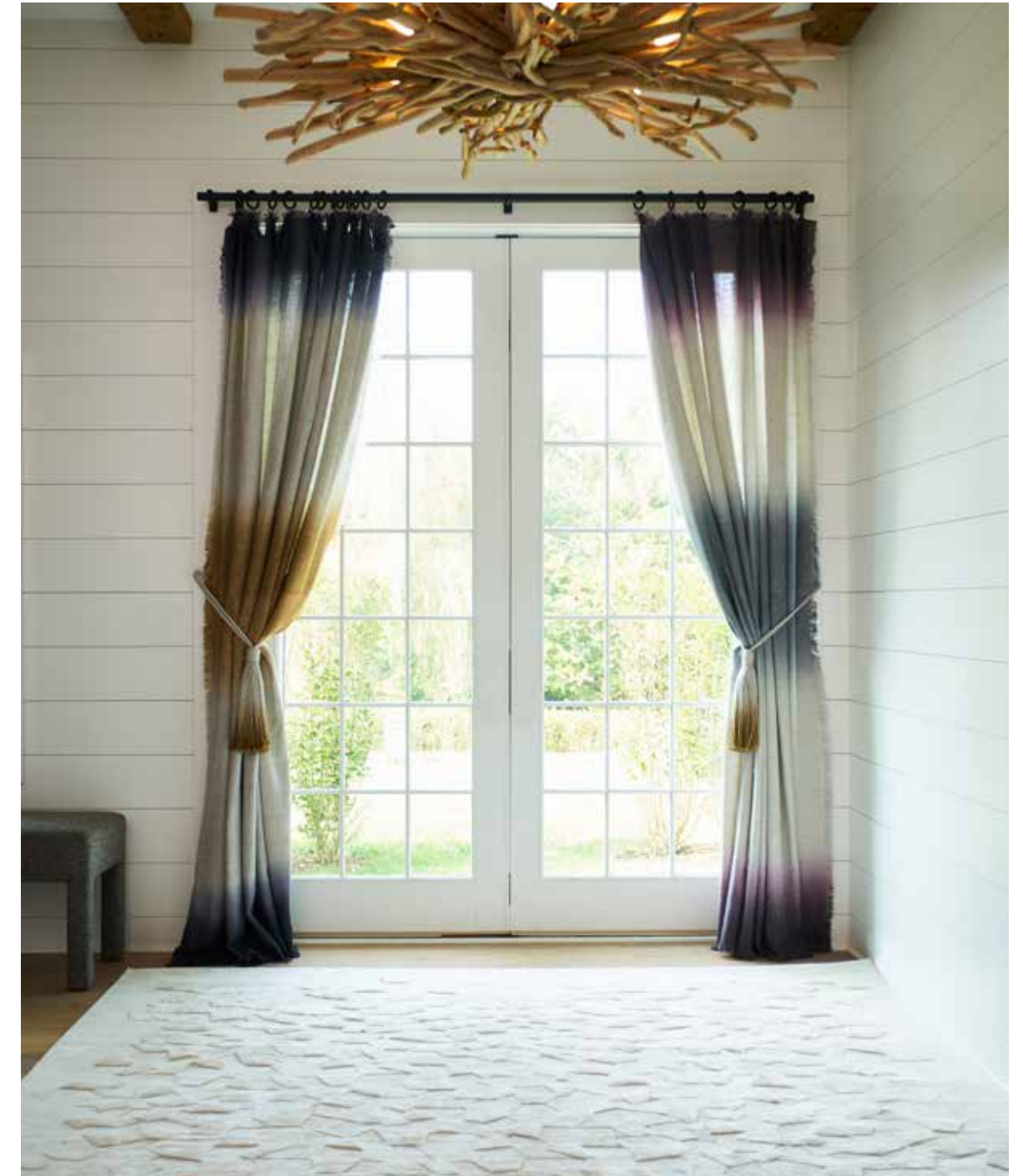
31 Curtains: Ombré Duo in Sphinx & Alexandrite; Curtain Tie Backs: Ombré in Gold; Rug: Lenox in Bluff