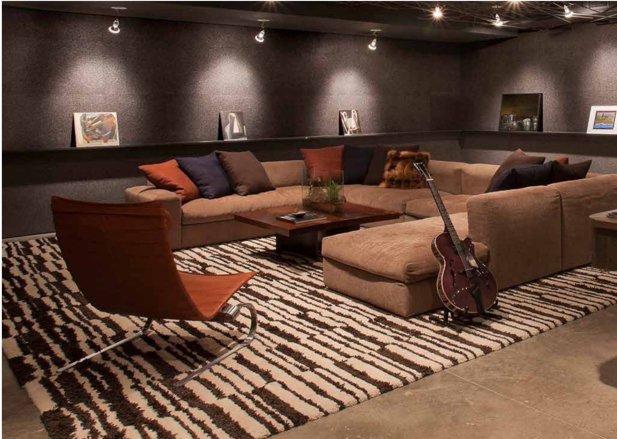
56 Rug: Custom Stonehenge Alpaca and Leather in White Alpaca and Chocolate Leather