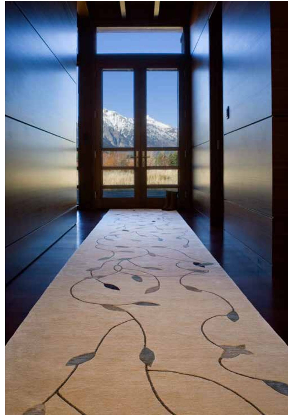
Rug: Falling Leaf Wool and Silk in Green