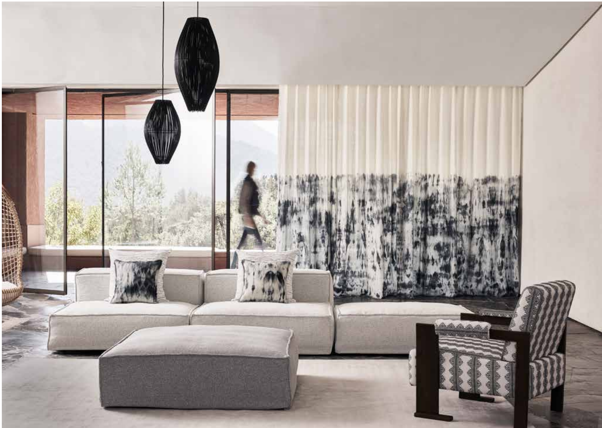
4 Drapery: Watercolor in Smolder; Pillows: Watercolor in Smolder and Positano in Arva; Sofa: Froth in Venus; Ottoman; Froth in Stingray, Chair: Eden in Basalt; Rug: Silk Ombré in Palladium