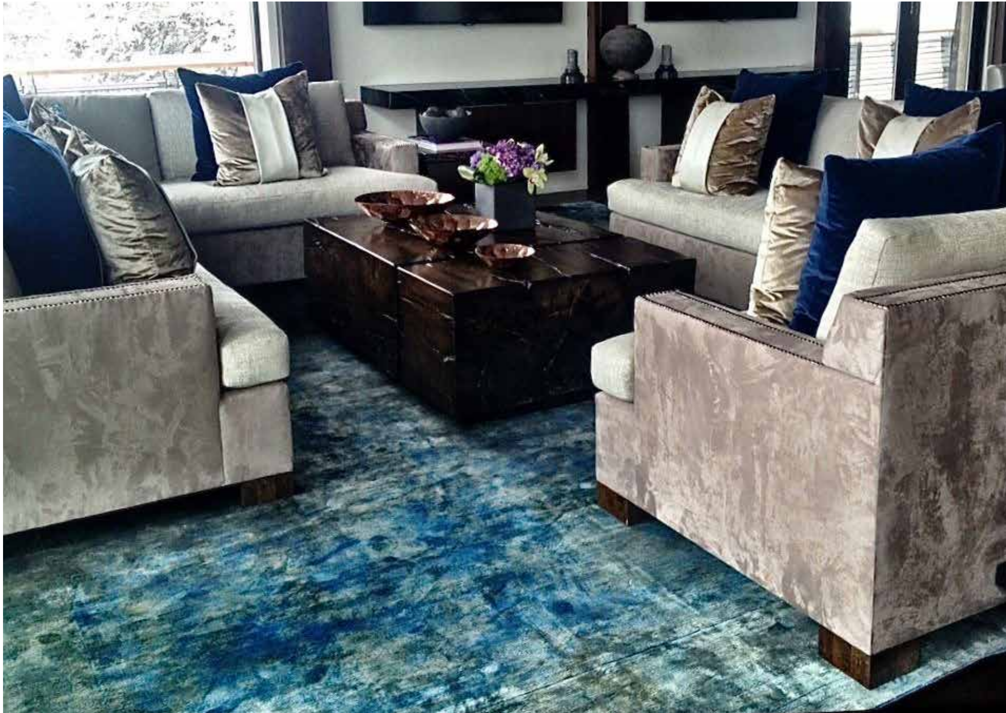
50 Rug: Vintage Wash Silk in Snorkel Blue