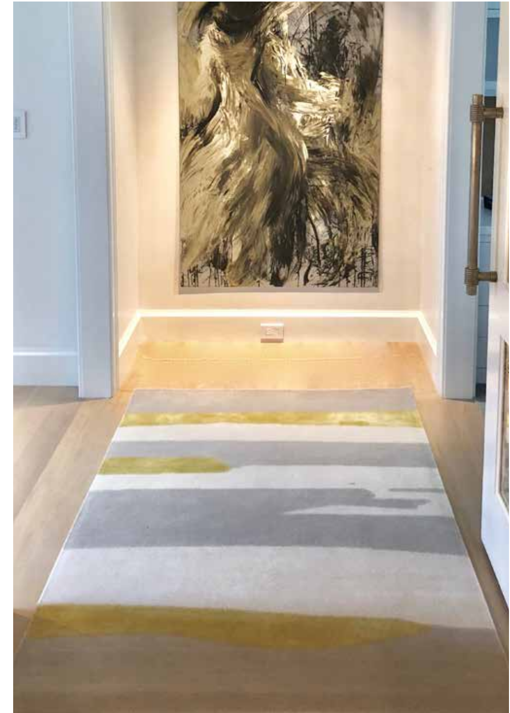
Rug: Brushes Wool and Silk in Celery 57