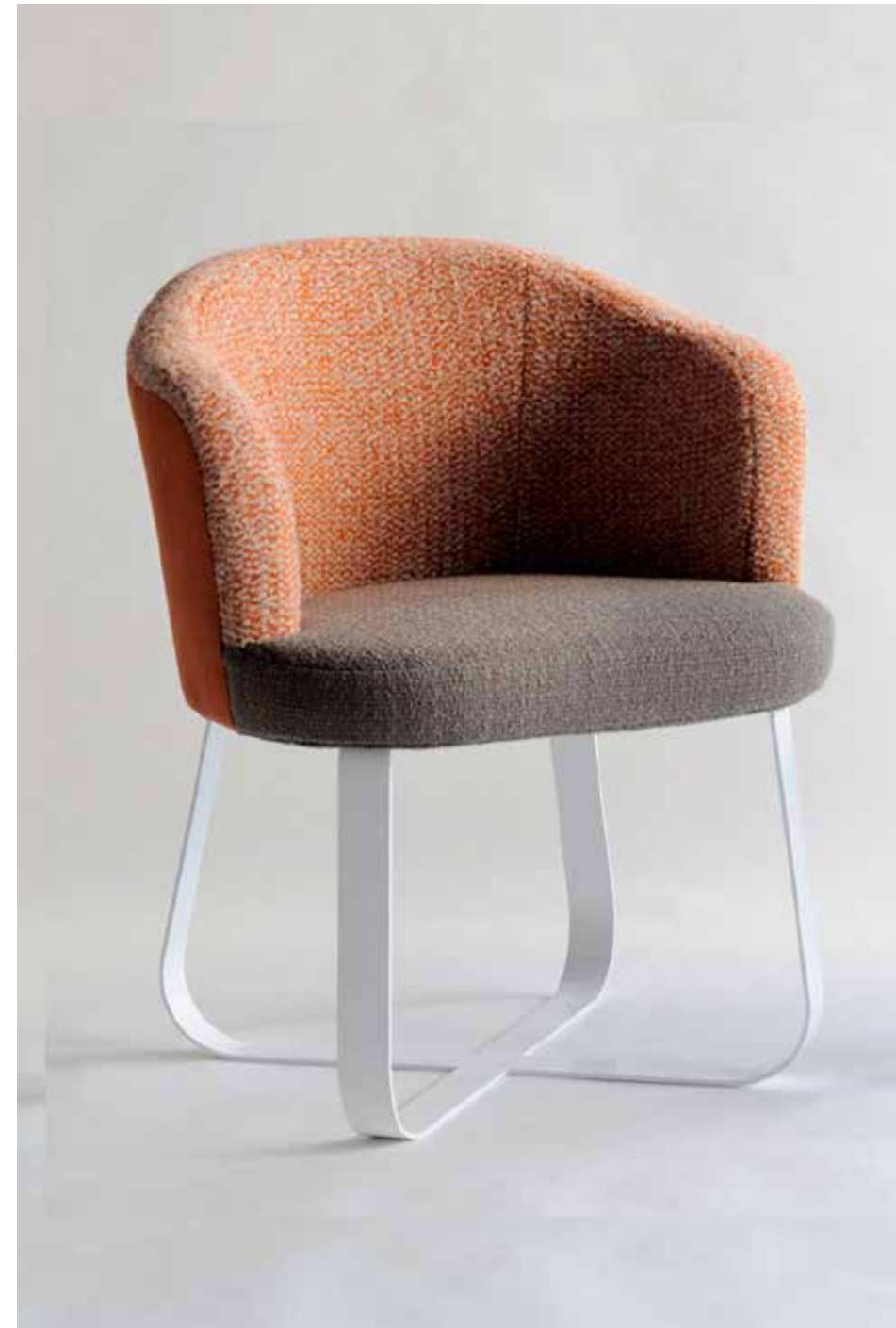
Primi Chair: Double Weave Alpaca Bouclé Foam in Mandarin and Oatmeal