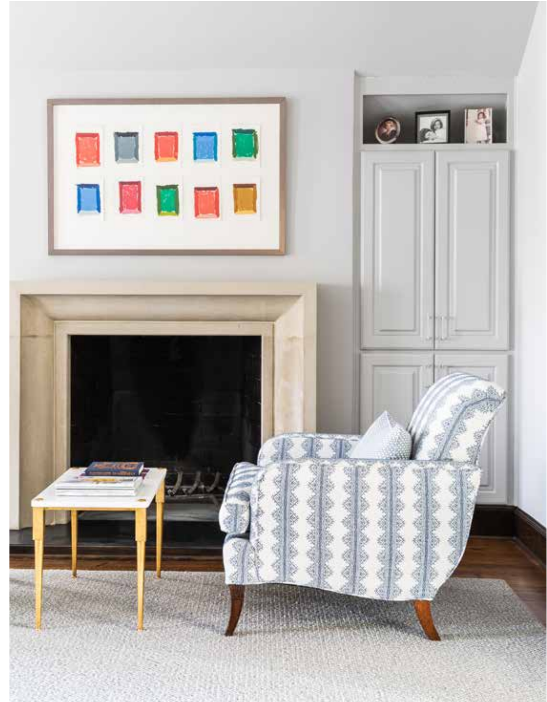
Chair: Eden in Adrift 19