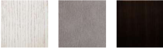
FAWN-STAINED OAK TOP