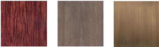
HIGH GLOSS WALNUT TOP