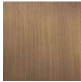
BRASS FINISH DETAILS

ALTERNATIVE FINISH COMBINATIONS AVAILABLE, SEE FBC LONDON FINISHES LOOKBOOK FOR REFERENCE OR CONTACT FBC LONDON TO SPECIFY BESPOKE FINISHES FOR YOUR ORDER. (BESPOKE DESIGN FEE CHARGES MAY BE APPLICABLE)