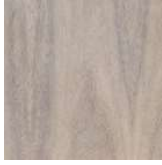
WHITE-GREY WALNUT BODY