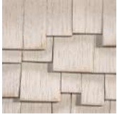
WHITE-CHIPPED OAK DRAWERS