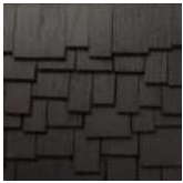
CHOCOLATE CHIPPED OAK DRAWERS