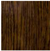
HIGH GLOSS OAK BODY