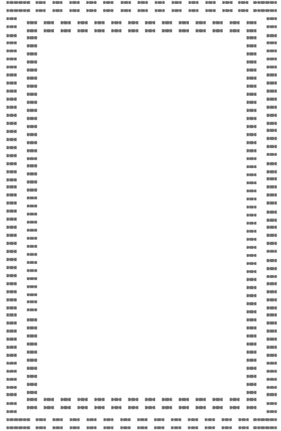
2 X 3' SHOWN