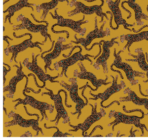
GOLD VELVET / LINEN